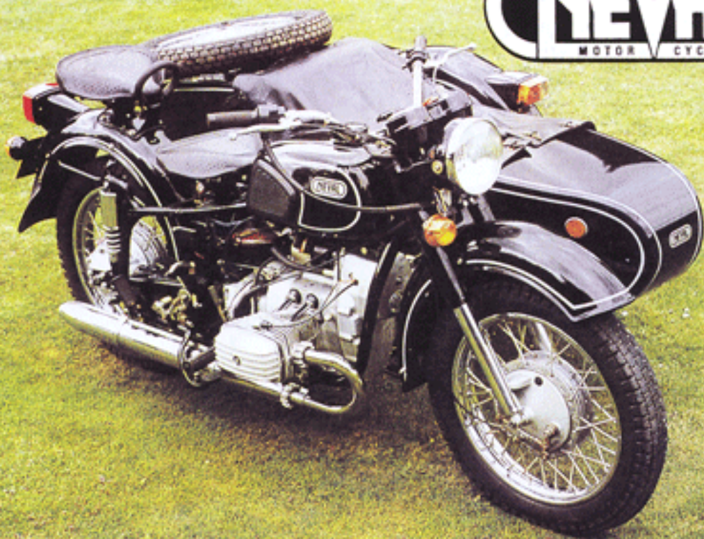
DNEPR 11 WITH MILITARY SIDECAR (DNEPR 16 WITH TWINWHEEL DRIVE)